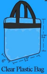
Clear Plastic Bag